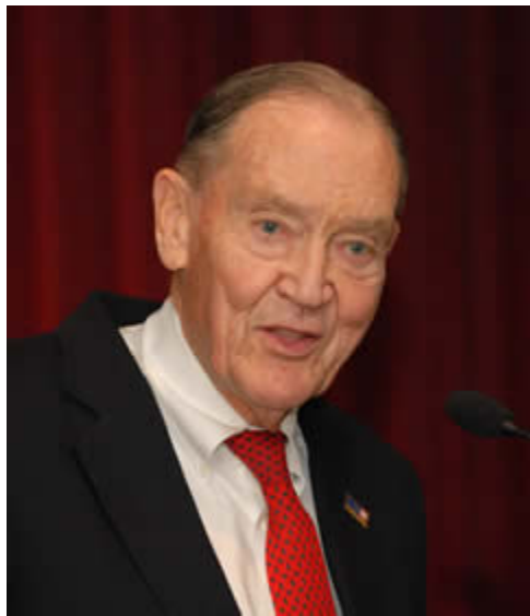
Mr. John C. "Jack" Bogle