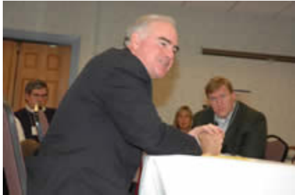
Mr. Pat Meehan fields questions from the DVFLN members about prosecuting perpetrators of corporate fraud.

Delaware Valley Financial Leaders' Network forum, held on October 24, 2006, featured a presentation on corporate fraud by Mr. Pat Meehan, United States Attorney. The event was cosponsored with the academic departments of Accounting and Finance and Alvarez & Marsal Consulting.