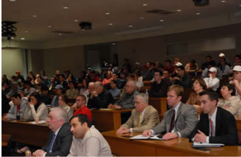
A packed house in Wolfington tele-torium